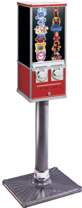
Flat-Pak on BS250A-29