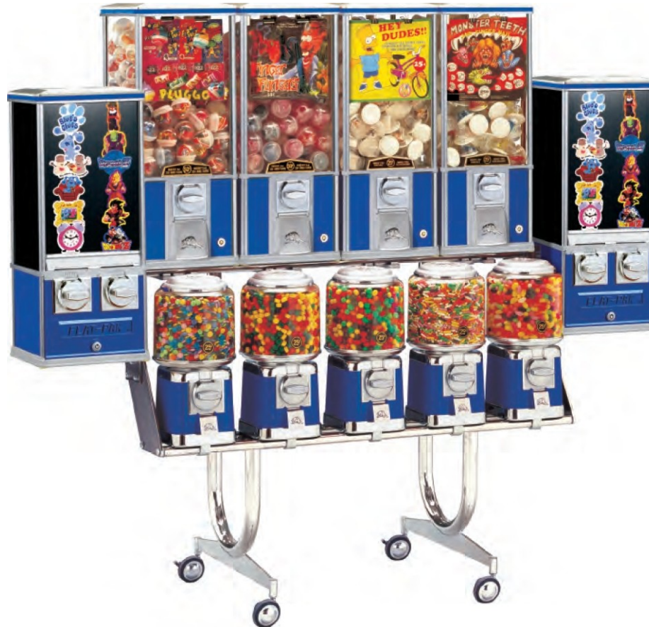
Flat-Pak on BSB00D-33