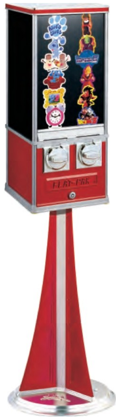
Flat-Pak on BS150Stand